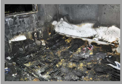
Toddler dies in Spokane fire, his dog huddled at his side ■